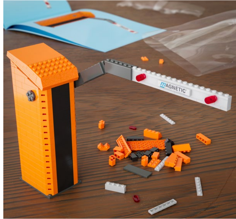
Access Pro: Brick edition