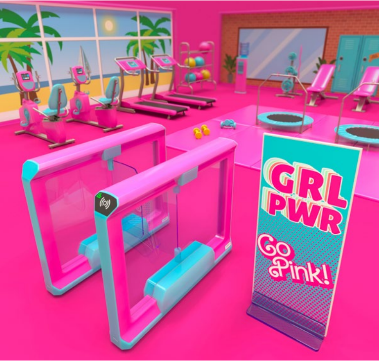
mWing: GRL PWR edition

These product images have been issued for marketing purposes only. The special edition products shown are not available for sale.